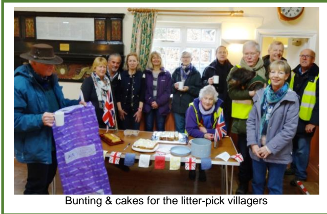
Bunting & cakes for the litter-pick villagers