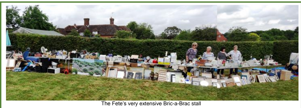
The Fete's very extensive Bric-a-Brac stall